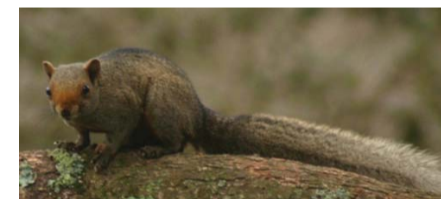
Fig. 4. Callosciurus erythraeus