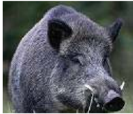
Fig. 5. Wild boar.

The wild boar, Sus scrofa , is native to Eurasia and northern Africa. In the early 1900's it was introduced onto Argentina's ranches as a game animal for hunting. During 1914 many individuals escaped, establishing feral populations and spreading their distribution over several provinces. In 1953, a national law declared the wild