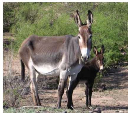
Fig. 2. Equus assinus – © Ramiro Ovejero

The majority of the species are from Eurasia, and most of their entry pathways were associated with human activities (e.g. sport hunting, food and fur industry).