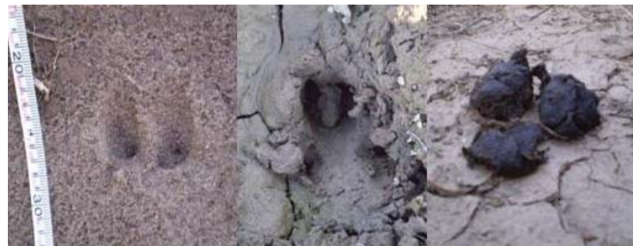
Fig. 9. Tracks and faeces – © Fernanda Cuevas