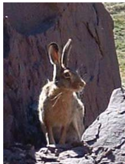
Fig. 3. Lepus europaeus – © Agustina Novillo

Alien mammals display good climatic matching (i.e. occupy ecoregions similar to their native ranges), and some species have experienced a range expansion to new habitat types (e.g. hare, rabbit and wild boar).