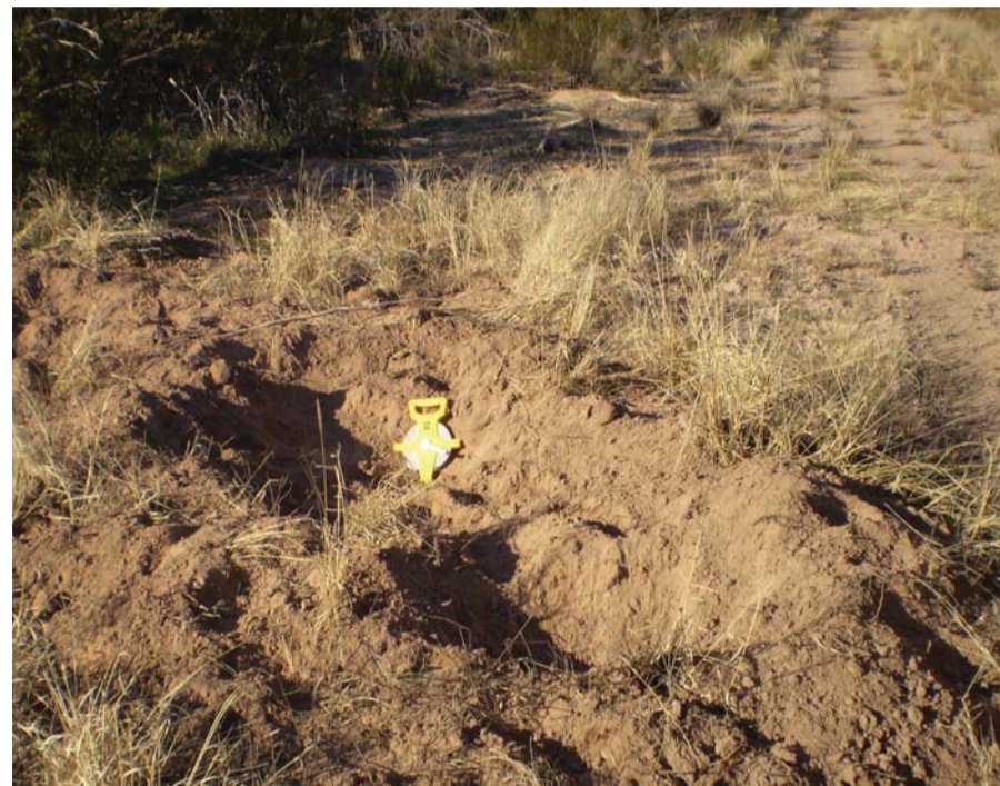
Fig. 8. Soil rooting by wild boar

It prefers damp areas in coniferous, deciduous or mixed forests, marshes and grasslands. In Argentina the wild boar expanded its geographic range from the grasslands of western Patagonia to the shrublands of central Argentina. In Mendoza province the wild boar has invaded the protected areas of the MaB Reserve of Ñacuñán, (site under study) and Llancanelo (a wetland RAMSAR site).