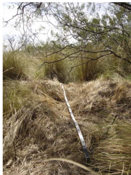
Fig. 6. A nest built by wild boar to give birth and to rest in