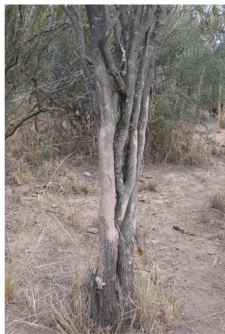
Fig. 7. Signs of rubbing: Once a boar leaves a mud bath, it rubs its body against trees, rocks or weeds

boar a “plague” species because of the economic damage caused to agriculture and livestock rearing activities.